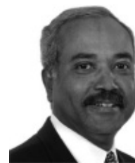
Director since 2002 Age: 64