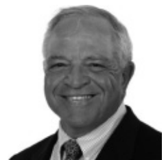
Director since 2002 Age: 67