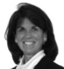
Director since 2003 Age: 58