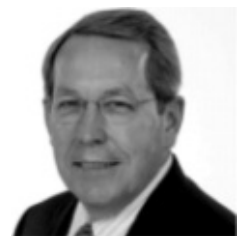
Director since 2005 Age: 66